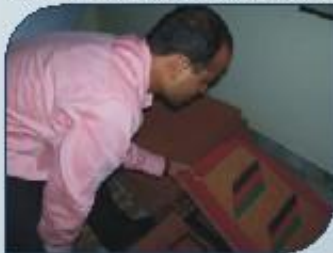
Sample by Buyer

A BDS provider has facilitated a marketing MOU between J D Agencies & Venice coir consortia for supply of coir door mats & mattings to Reliance mart, Spencers, Magna, MORE, Subhiksha and Big Bazar. The initiative will connect the MSME to markets in Andhra Pradesh, Gujarat, Maharashtra & Rajasthan.