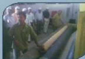
At Weaving Unit