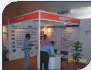
Booth At IICF - 07

The project participated in India International coir fair - 2007 from 7-11 Dec. 2007 in Kochi & interacted with buyers, coir MSME's & BDS providers. 80+ one to one meetings were held with MSME's , buyers & BDS providers.