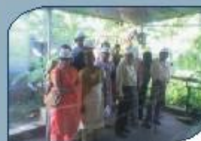
At Spinning Unit