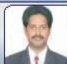
Koleshwar Rao Cell and SME Expert