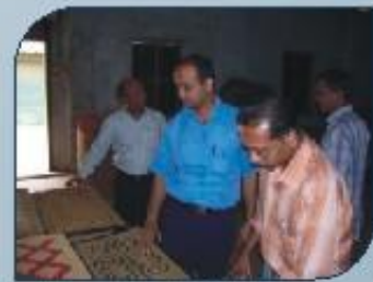
Buyer at MSME Unit